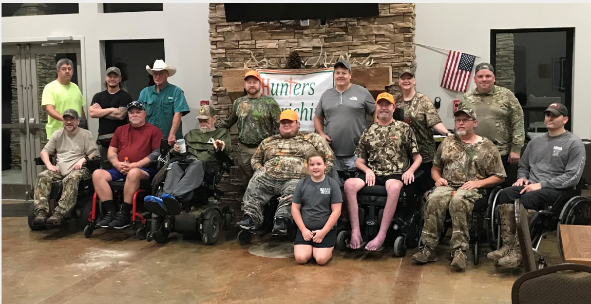
Chesapeake helped sponsor a hunt hosted by Sabine Parish HELP (Helping Enrich Lives of People), which gives people with physical exceptionalities and veterans the opportunity to enjoy hunting and the outdoors.