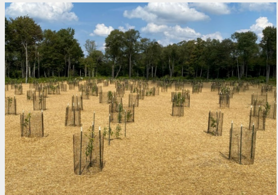
The finished product.